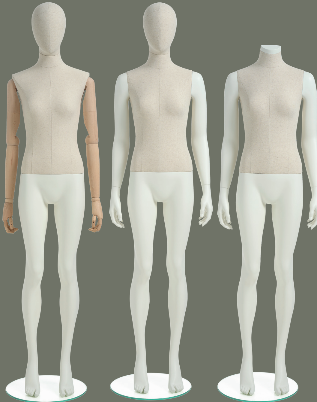
PMFO2 + HEADFB01